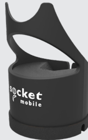
Charging Dock SKU# AC4133-1871