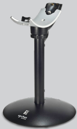
Charging Stand SKU# AC4076-1538