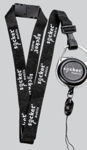
Lanyard - Black AC4100-1692